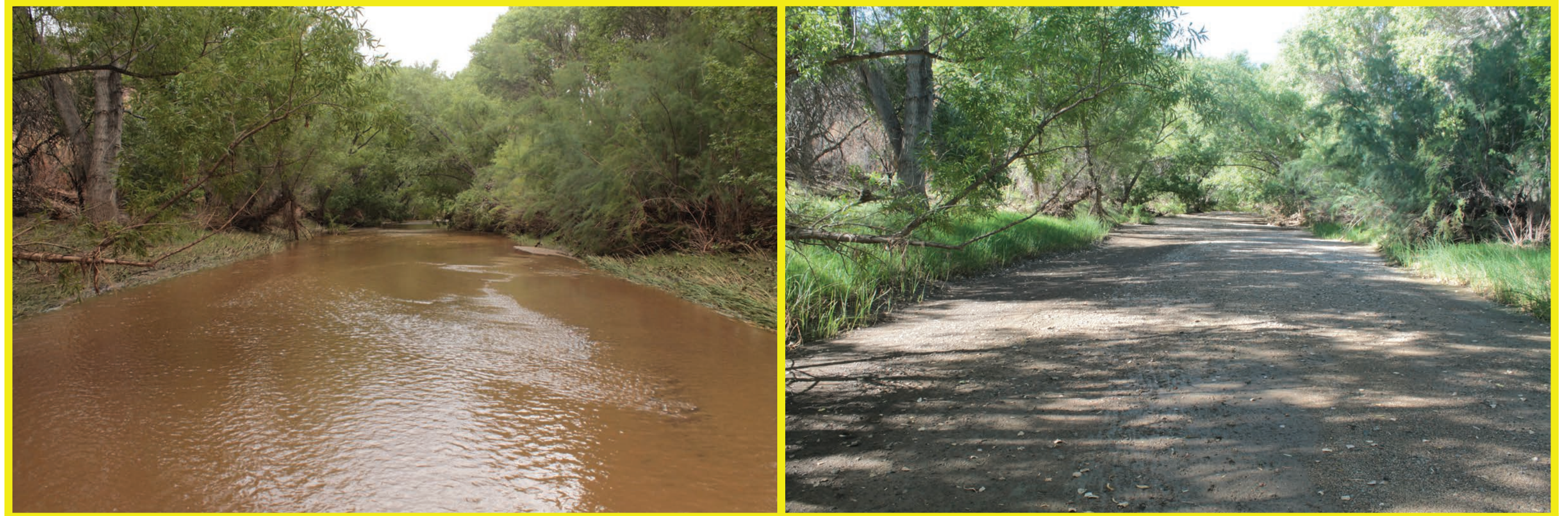
Plants Protect Stream Banks from Erosion

Riparian resilience is the ability for the system to recover from disturbances and will promote the long-term sustainability of our watersheds.