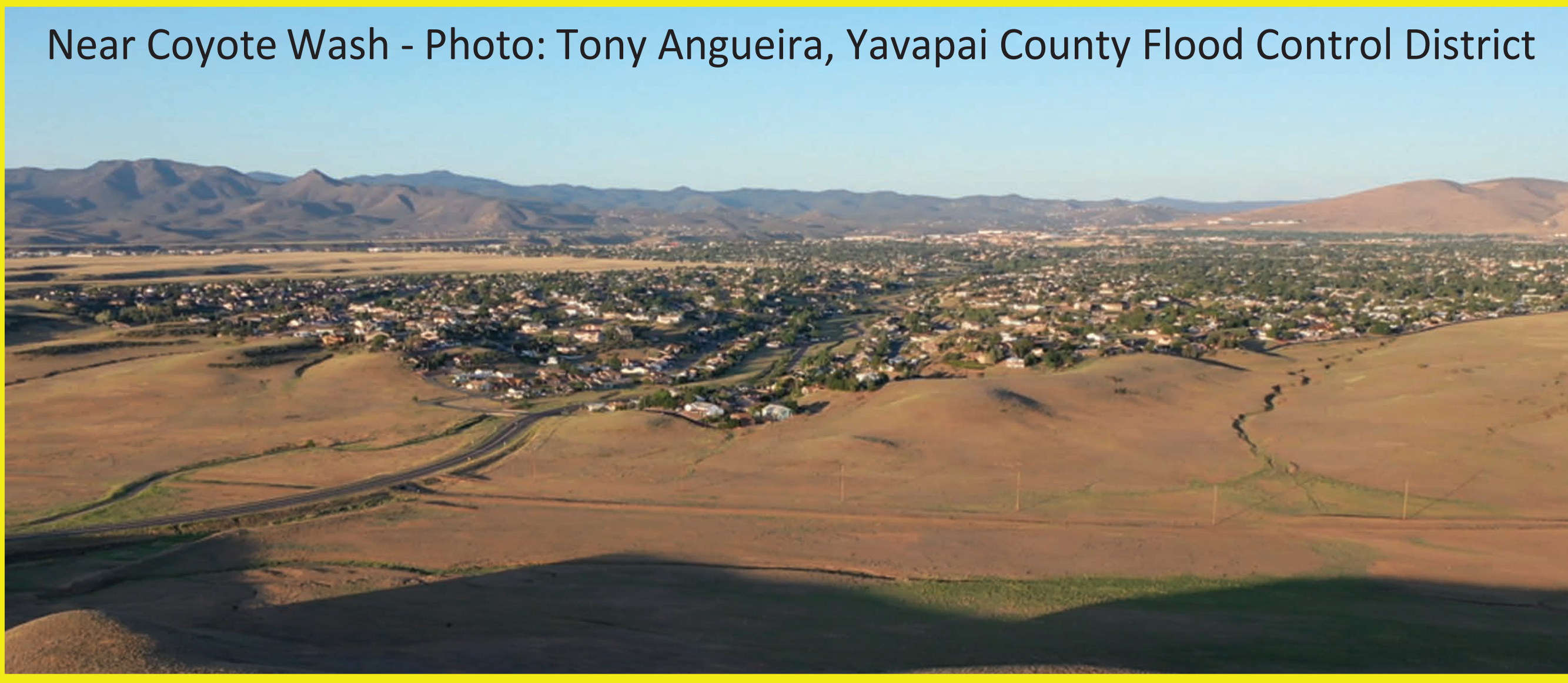
Near Coyote Wash