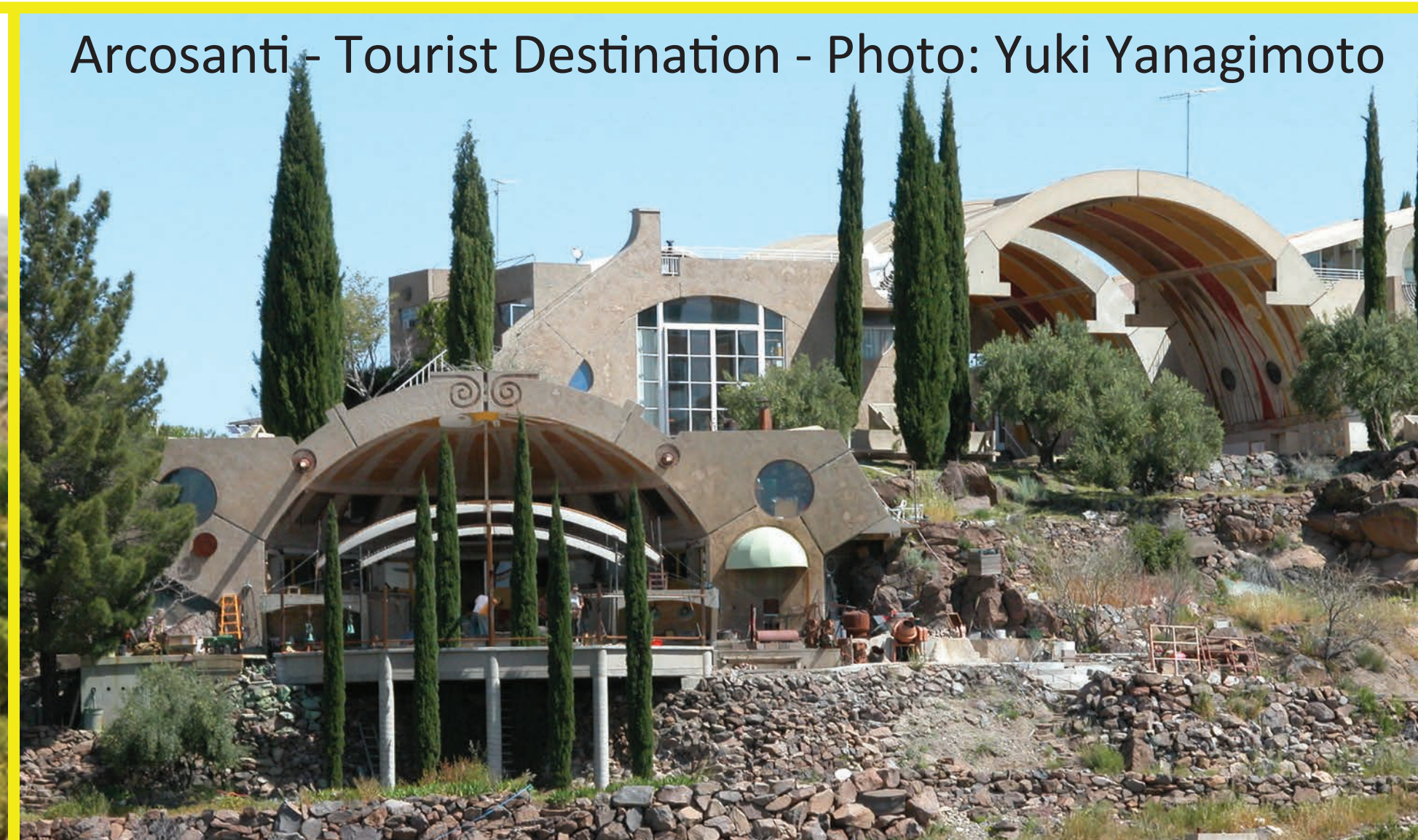
Arcosanti - Tourist Destination