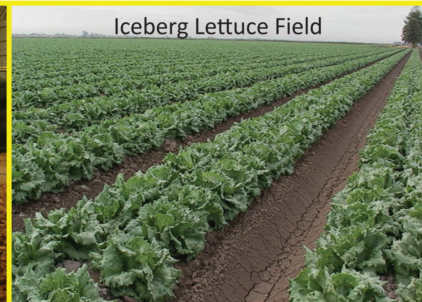
Iceberg Lettuce Field